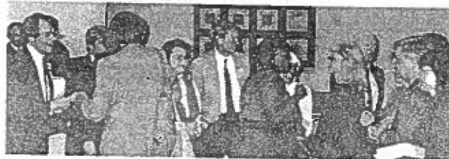
Conferees on break