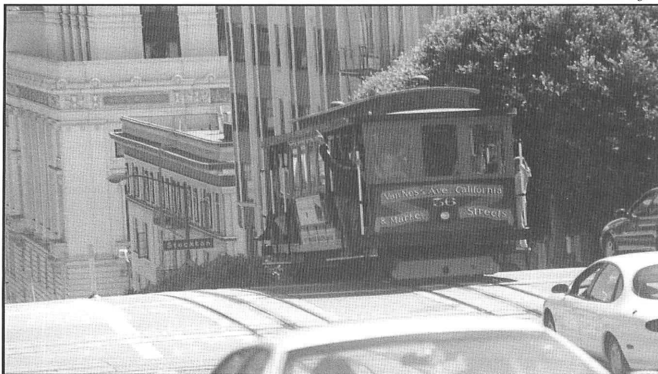
Cable cars and sunny skies welcomed Society members to the 1998 APA convention in San Francisco, CA last August.